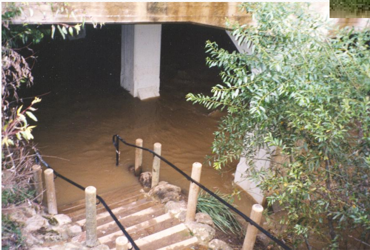
Too Much Water