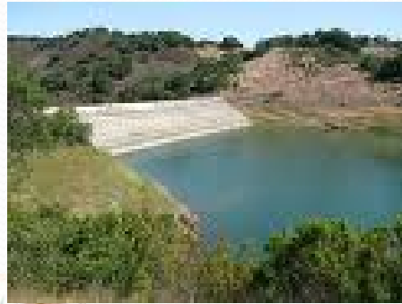
Lake Chabot Dam